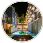
Villa Mercedes, Curio Collection by Hilton