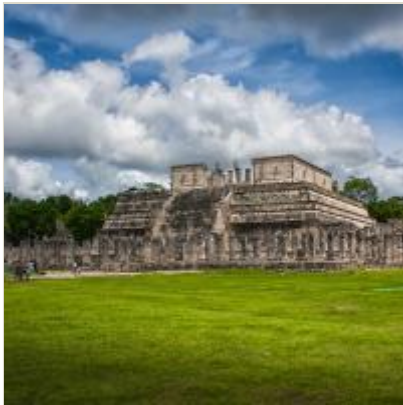
Discover the Wonder of Chichén Itzá