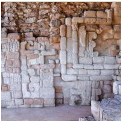
Private Ek Balam & Río Lagartos Revealed