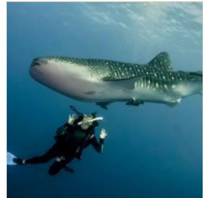
An Intimate Whale Shark Encounter