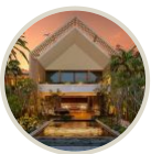
Banyan Tree Mayakoba