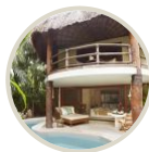
Viceroy Riviera Maya