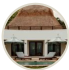
Maroma, A Belmond Hotel, Riviera Maya