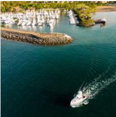
Ocean Rhythms Guide the Journey