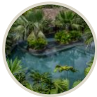
Tabacón Thermal Resort & Spa