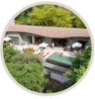
Andaz Peninsula Papagayo Resort, Costa Rica