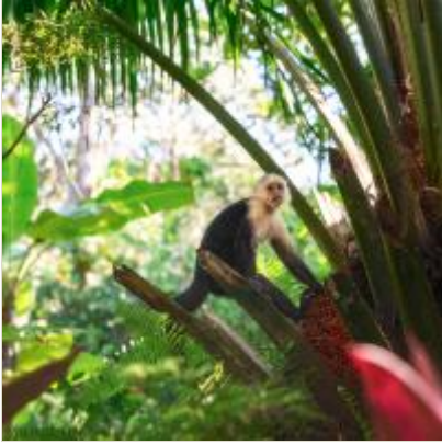
Gentle Encounters with Rescued Wildlife