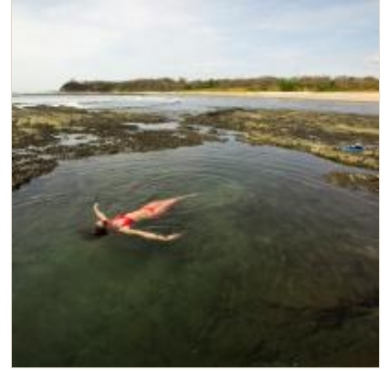
Renewal Guided by Land & Spirit