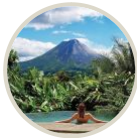
The Springs Resort & Spa