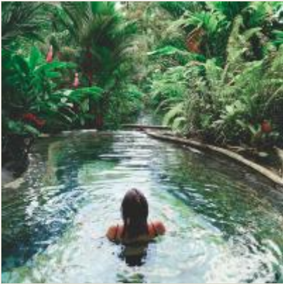
Thermal Tranquility in Sacred Surroundings