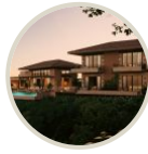
Nekajui Peninsula Papagayo, a Ritz- Carlton Reserve