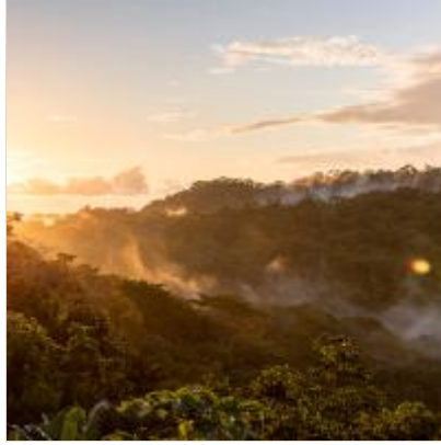
Landscapes Born of Fire & Time