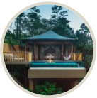
Nayara Tented Camp