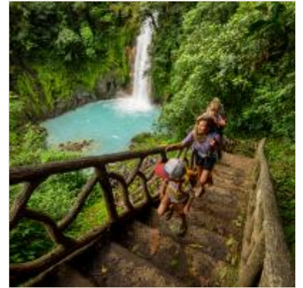
Where Wilderness Awakens Connection