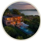
Four Seasons Resort Peninsula Papagayo, Costa Rica