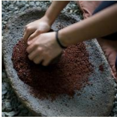
Pathways through Heritage & Tradition