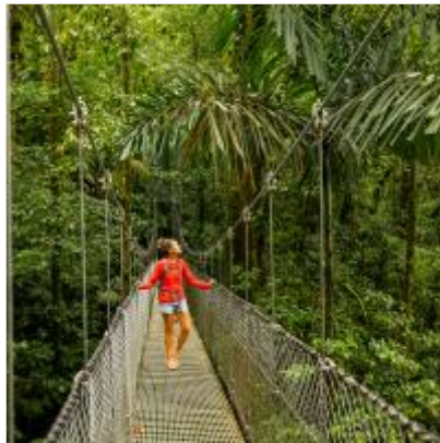
The Pulse of Adventure, Redefined