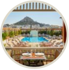
Hotel Grande Bretagne, a Luxury Collection Hotel, Athens