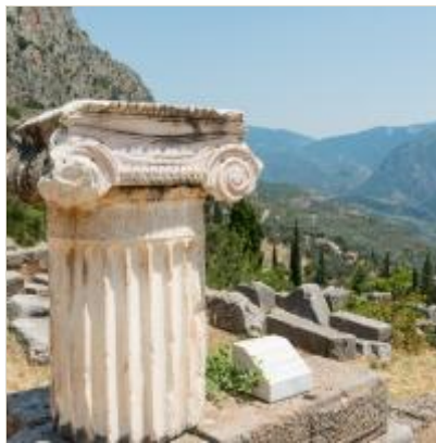
Oracle's Echo: Journey to Delphi