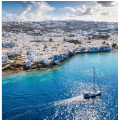
Mykonos Private Sea Escape