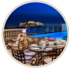
King George, a Luxury Collection Hotel, Athens