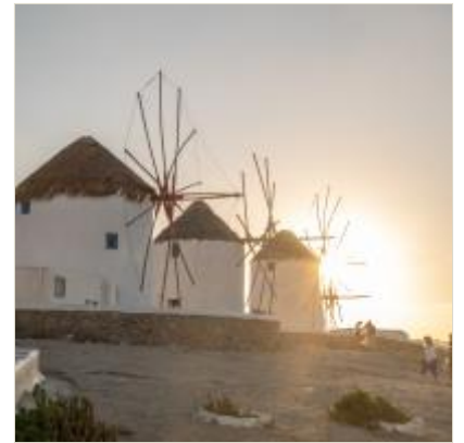
Windmills & Whitewashed Lanes of Mykonos