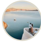
Mystique, a Luxury Collection Hotel, Santorini