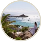
Myconian Ambassador Relais & Château