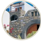
Mykonos Grand Hotel & Resort