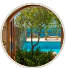
Elounda Mare Hotel, Relais & Châteaux