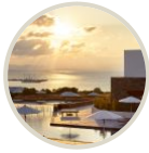
Summer Senses Luxury Resort