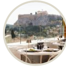
NEW Hotel Athens