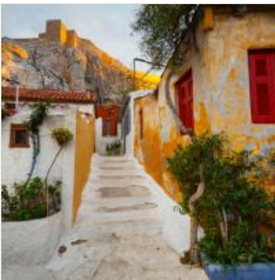
Past Meets Present in Timeless Athens