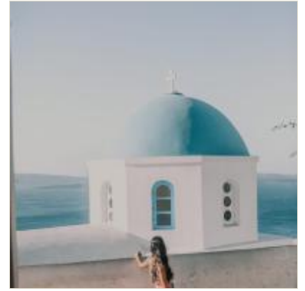
Iconic & Intimate Santorini Revealed