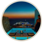
Mykonos Riviera Hotel & Spa