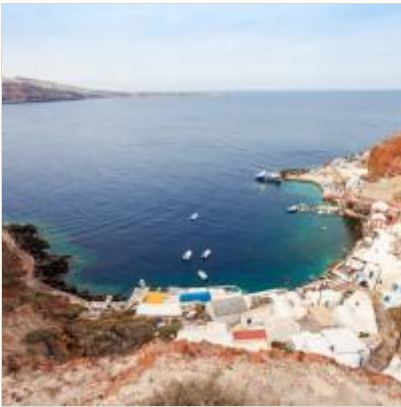
Caldera Waters. A Sparkling Day at Sea