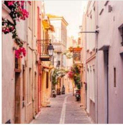
Explore Venetian & Vibrant Crete