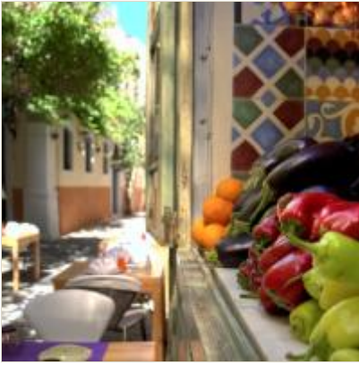
Knossos & Cretan Flavors Uncovered