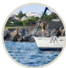
St. Nicolas Bay Resort Hotel & Villas